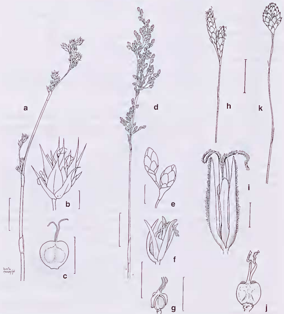
Fig. 5. a-c, Eurychorda complanata , female: a, inflorescence. b, spikelet. c, fruit (Lyne 357). d-g, Platychorda applanata , female: d, inflorescence. e, spikelets. f, young fruit. g, old fruit (Briggs 8642). h-k, Melanostachya ustulata , h-j, female: h, spikelets. i, female flower. j, fruit (Jackson, Jan 1913). k, male spikelet (Briggs 785). Scale bars: a, d = 2 cm; b, c, e-g = 2 mm; h, k = 1 cm; i, j = 1 mm.

A genus of two species (one undescribed) of the south-west of Western Australia, in wet or seasonally wet sites.